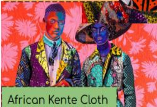
African Kente Cloth