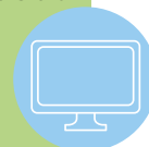
Illustration is another creative career that you may wish to consider. Here is free library of illustration resources to help you on your way to monetizing your skills.

Are you considering a career in publishing? The Society of Young Publishers are pleased to present Inside Publishing, the podcast series interviewing industry experts on everything publishing. You can listen here .